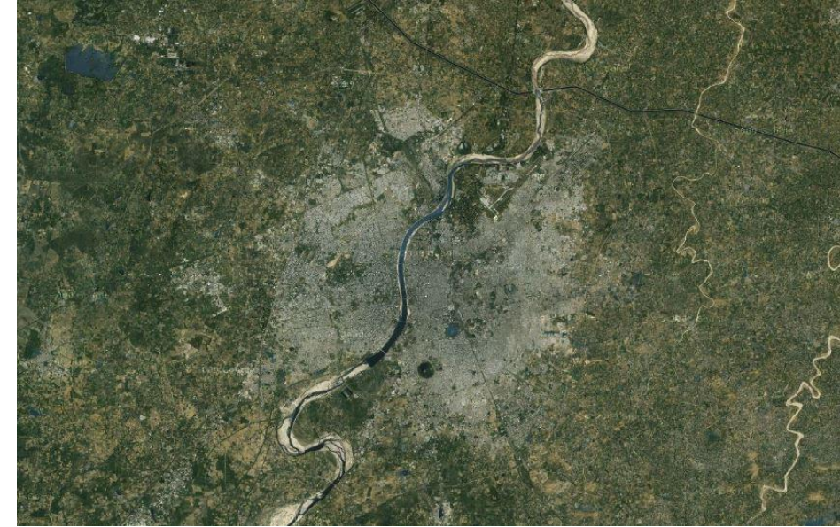
Aerial view of Sabarmati River