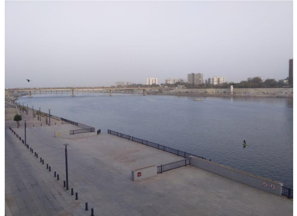
View of Sabarmati Riverfront from Gandhi Ashram, Ahmedabad, Gujarat, India