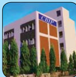
CBIP office at Chanakyapuri, New Delhi (1980 onwards)