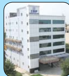
CBIP Centre of Excellence at Gurgaon (2013 onwards)