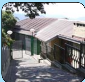
CBIP Office at Shimla (1927-1952)