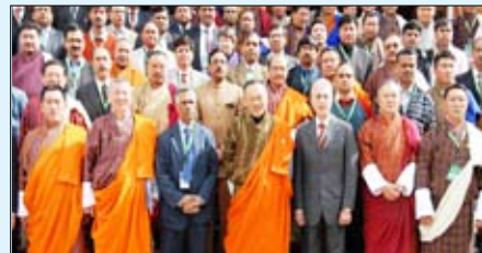
International Conference on Accelerated Development of Hydropower in Bhutan - Opportunities & Challenges on 16-18 November 2010, Thimphu Bhutan.