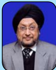
K.S. Popli CMD, IREDA