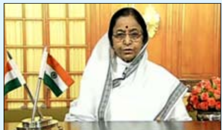
Her Excellency the President of India, Smt. Pratibha Devisingh Patil addressed the participants through recorded video during World Tunnel Congress organised by CBIP on 21-24 September 2008, Agra