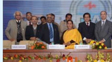
Sushri Uma Bharti, Hon'ble Union Minister, Water Resources, River Development & Ganga Rejuvenation Govt. of India; with the invitees and CBIP Officers during CBIP Day Celebrations on 1st January 2015, New Delhi