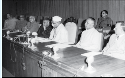
Hon'ble President of India Dr. Rajendra Prasad inaugurated the 30th (1959) Annual Session of the Board held at Vigyan Bhavan, New Delhi from 23rd - 24th November, 1959.