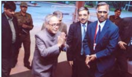
Shri Pranab Mukherjee, Hon'ble Union Finance Minister, was the Chief Guest for the ICID Valedictory Session on 11th December 2009 at New Delhi