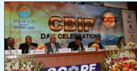
Shri Satya Pal Singh Hon'ble Union Minister, Ministry of State Human Resources Development and Water Resources, River Development & Ganga Rejuvenation Govt. of India; during CBIP Day Celebrations on 3rd January 2018, New Delhi