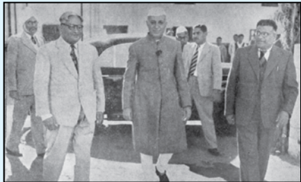
The then Prime Minister of India, Late Pandit Jawahar Lal Nehru arriving to inaugurate the Silver Jubilee Session of the CBIP in 1952