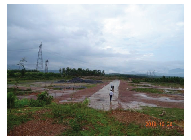
Figure 7.1 : Newly constructed emergency spillway at Phu Vinh Dam

reservoir volume is 81Mm<sup>3</sup> and the maximum height of the main dams is 40m. The original Check Flood, estimated based on the Vietnamese standards, was 1,153m3/s and the Check Flood estimated in accordance with the POM, is 1,358m<sup>3</sup>/s. In order to provide an additional flood discharge outlet, an emergency spillway is to be constructed. However, although the main rehabilitation works are under way, the works on emergency spillway have not started yet because of the land take issues with the Forestry Department. The DSPE recommended that this situation is resolved as soon as possible; it is recommended that the contractor prepares a plan of emergency measures for the situation when the rehabilitation works are ongoing and there is no emergency spillway in place;