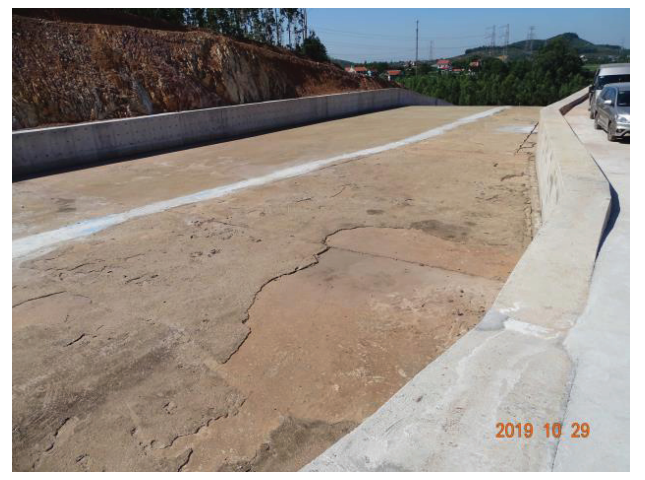
Figure 7.2 : Khe Che Dam: the existing spillway has been widened (the white line shows the side wall of the original spillway)