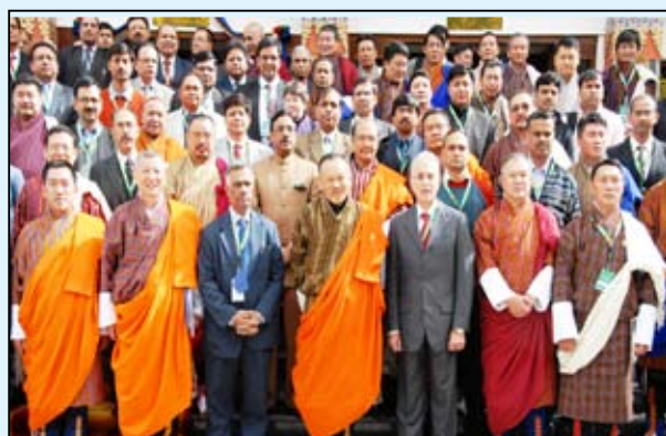
International Conference on Accelerated Development of Hydropower in Bhutan - Opportunities and Challenges. Group photo of Participants of the Conference with Hon'ble Prime Minister (First Row in the centre) and Hon'ble Minister of Economic Affairs of Royal Govt. of Bhutan (First Row 2nd from left) on 16-18 November 2010, Thimphu Bhutan.