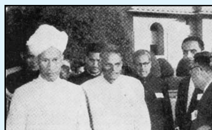
Late Dr. S. Radhakrishnan, the then President of India, arriving on the occasion of 6th Congress on Irrigation and Drainage in 1966