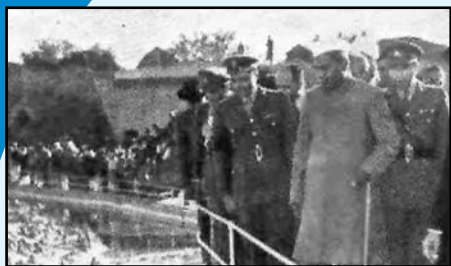
Late Dr. Rajendra Prasad, the then President of India, at the Indian International Engineering Exhibition in 1951