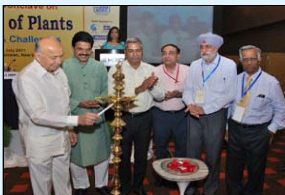
Hon'ble Union Minister of Power Shri Sushilkumar Shinde inaugurating the National Conclave on Balance of Plant on 12th July 2011 at New Delhi managed by Central Board of Irrigation & Power on behalf of Ministry of Power & Central Electricity Authority