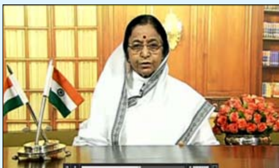
Her Excellency the President of India, Smt. Pratibha Devisingh Patil addressed the participants through recorded video during World Tunnel Congress (First time in India) organised by Central Board of Irrigation & Power on 21-24 September 2008, Agra