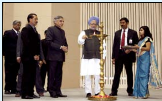
Hon'ble Prime Minister Dr. Manmohan Singh inaugurating the 5th Asian Regional Conference on 10th December 2009 at Vigyan Bhawan, New Delhi.