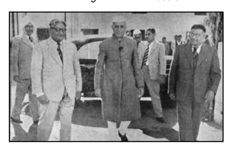
The then Prime Minister of India, Late Pandit Jawahar Lal Nehru arriving to inaugurate the Silver Jubilee Session of the CBIP in 1952